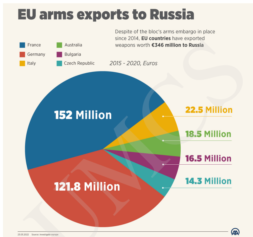
Fig.3. EU Arms Exports to Russia within 2015–2020