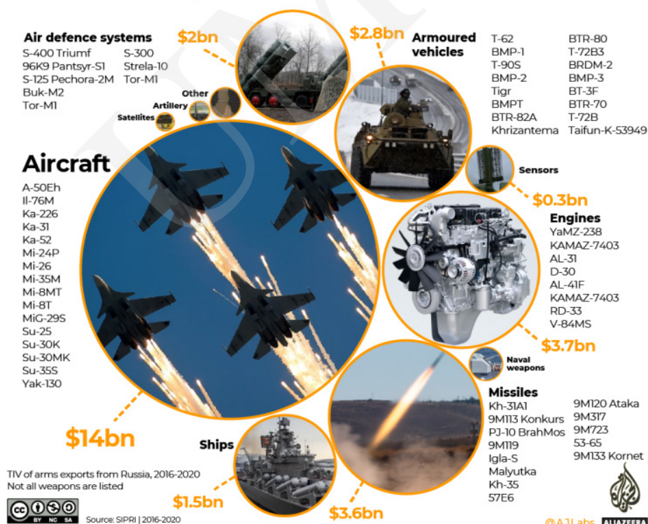
Fig. 2. Types of Weapons, which Russia exported to the International Market within 2016–2020

Half of Russia's arms exports are aircraft. Many Russian weapons are upgrades to its Soviet-era arsenal but it is developing more advanced systems . Between 2016 and 2020, Moscow sold $28bn of weapons to 45 countries.