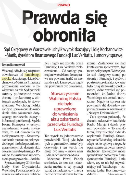
Figure 12. ND – “judges perform their duties, i.e. they adjudicate – in a right way (as expected) or in a wrong way (contrary to the expectation)”