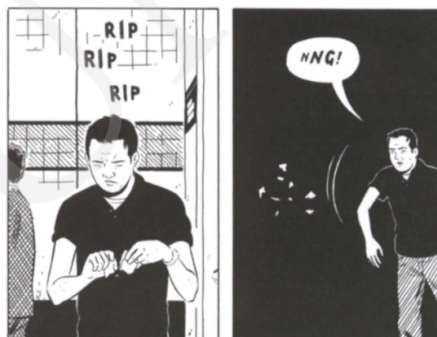
Fig 4. Tomine, A. (2012) Shortcomings . London: Faber and Faber, p. 104.

Motion lines are scarce and subtle and appear usually when Ben slams the phone or throws something on the ground: