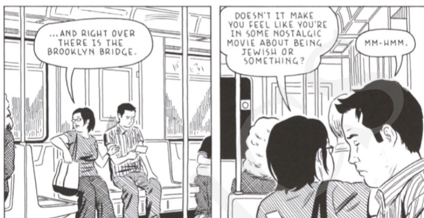
Fig 20. Tomine A. (2012). Shortcomings . London: Faber and Faber, p. 79.

A similar reference is also made by Kim, when she reflects on living in New York: