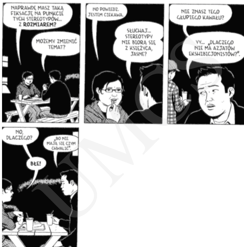
Fig 27. Tomine, A. (2010). Niedoskonałości . Trans: Murawska, A. Warszawa: Kultura Gniewu, p. 57.

The joke in the English version is based on the difference between the words ‘Caucasian’ and ‘Asian,’ which, apart from the meaning, is the syllable ‘cauc’ at the beginning of the former. The pun bases on the alleged correspondence between the length of these words and the size of Caucasians’ and Asians’ penises as well as the homophonic resemblance between ‘cauc’ and ‘cock.’ It is impossible to convey it literally into Polish, as ‘Caucasian’ translates into ‘biały’ ( white ) and ‘Asians’ into ‘Azjaci.’ There is no similarity between the two. Murawska’s solution is well-conceived, as it conveys the same preconceptions and also regards the size of phalluses in a racist, though humorous, way, even though it is realized in a completely different way. The reaction of the Polish readers is likely to be the same as that of the readers of the original.