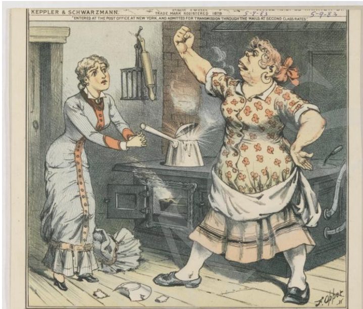
Figure 7. An overbearing Irish maid ( Puck , 1883)