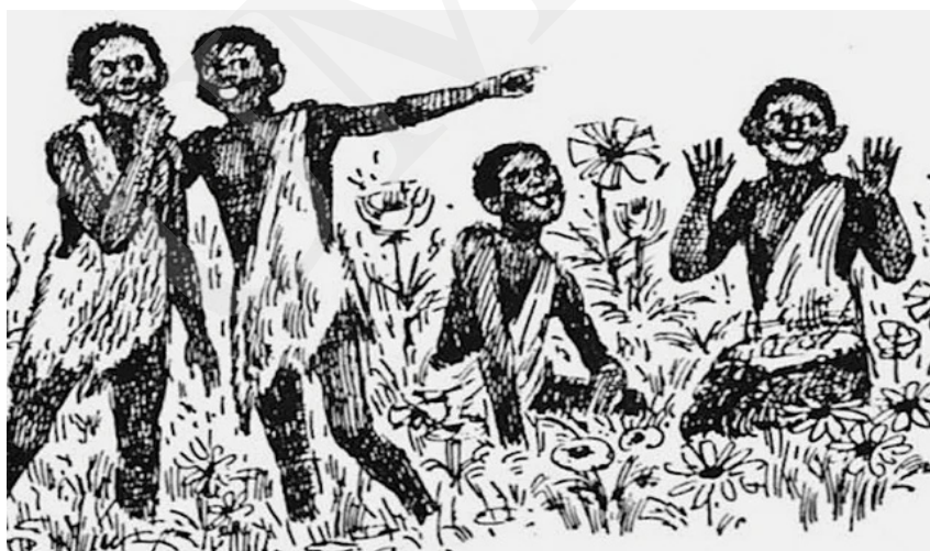
Picture 1. Black Oompa-Loompas illustrated by Faith Jaques in 1977 (copied from Treglown 1994).

The picture below presents illustrations in the first British edition in 1977, made by Faith Jaques.