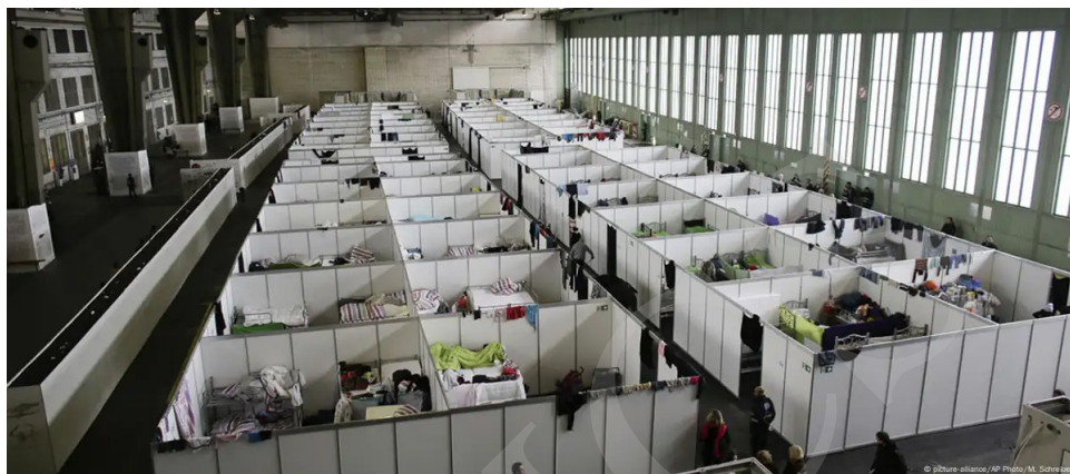
Picture: the refugee accommodation in the hangar of the airport Berlin Tempelhof, 2016

https://www.dw.com/en/berlin-to-stop-housing-refugees-in-tempelhof-hangars-in-theory/a-19415068