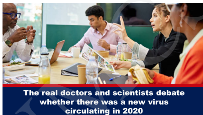
Figure 9. The Exposé, accessed on 19.01.2024.

The accompanying image includes what seems to be a representation of the vaccine and a syringe against a backdrop of what might be virus as well as a human heart. The use of the heart image alongside a sharp medical instrument, such as syringe, may elicit an emotional response concerning health and mortality, which are critical issues that affect everyone. Based on that it is to be assumed that the function of the image is evaluation, and the relationship between the image and text appears to be overlap, as the meaning is expressed metonymically.