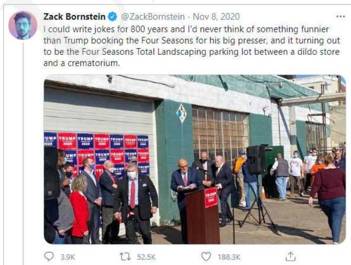
Fig. 4: A photograph of Trump’s press conference, commented on by @ZackBornstein

Another way Trump’s loss of the election was celebrated in meme-format occurred in the form of event references, such as the slow vote counting in Nevada (e.g. Haylock 2020) or in response to Trump’s final press conference. After it was announced that he would be giving a press conference not in the Four Seasons hotel but Four Seasons Total Landscaping parking lot, many memes were created that alluded to this event.