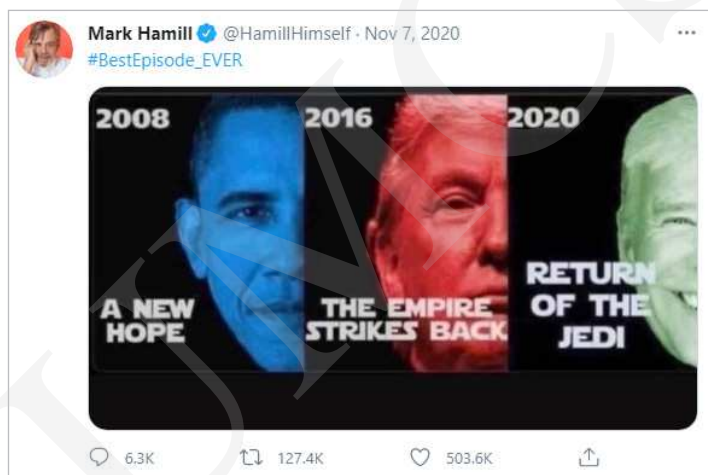
Fig. 2: The titles of the original Star Wars trilogy imposed on the American presidents from 2008 to 2020 (@HamillHimself, 2020).

Hence allusions to popular movies and TV shows form the base of many memes framing the weeks of the election week. Particularly references to such staples of geek fan culture as Star Wars , Marvel , and Game of Thrones were abundant, with even Mark Hamill, the actor playing Star Wars ' Luke Skywalker, sharing a highly popular meme after the election that was liked 500k times: