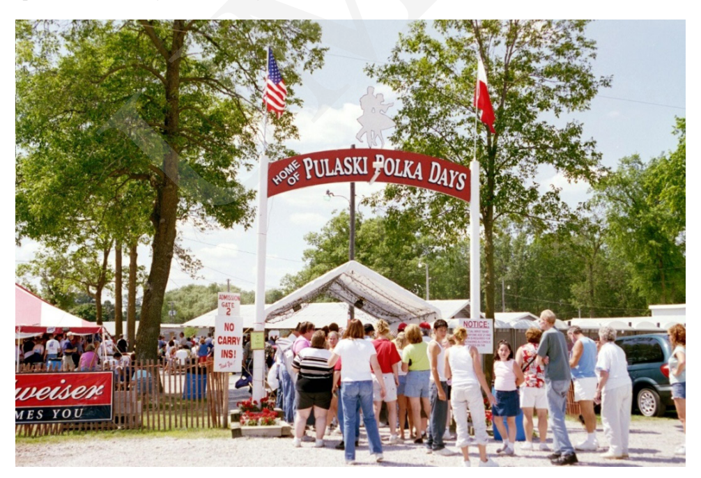
Figure 1. Entering the "neighborhood" at Pulaski Polka Days, 2004.

Recent scholarship on Polish American polka has argued that contrary to popular stereotype, polka is innovative hybrid alternative music and, furthermore, that preserving polka's history is an important, but often overlooked, part of preserving American multicultural history (Gunkel 2006, 5 - 8). This project continues that research by providing this spatially-framed study of the phenomenon of the seasonal polka festival. Over a period of five years, I visited polka festivals in North America as a participant observer, documenting the social and cultural landscape of these gatherings of polka festivals—understood as a diasporic ethnoscape--exploring the construction of ethnic space in the twenty-first century.