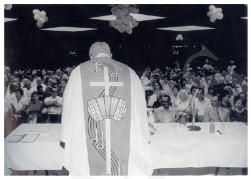
Figure 3. Priestly vestments at the International Polka Association's Polka Mass, 1983.

The carefully embroidered priestly vestments [See Figure 3] worn by the celebrant at polka Mass visually reflect this postmodern pastiche of ethnic identity. One vestment photographed by Dick Blau is beautifully adorned with The Black Madonna of Czestochowa, the most revered icon of Polish religious life. The Blessed Mother is depicted alongside a crucifix,--the instrument of salvation—musical notes, and an accordion—the instrument of ethnic dancehalls and taverns; tracing, in effect, that path from Polish Catholicism to polka-based Polish American ethnicity.