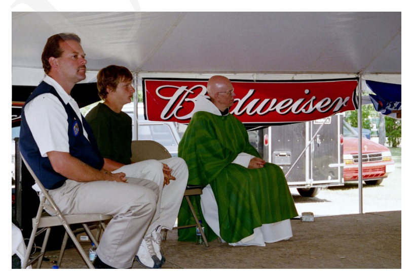
Figure 5. The Priest and Acolytes at Polka Mass, Pulaski Polka Days, 2004.

Figure 4. The Sacred and Profane merge at the Polka Mass, Pulaski Polka Days, 2004.