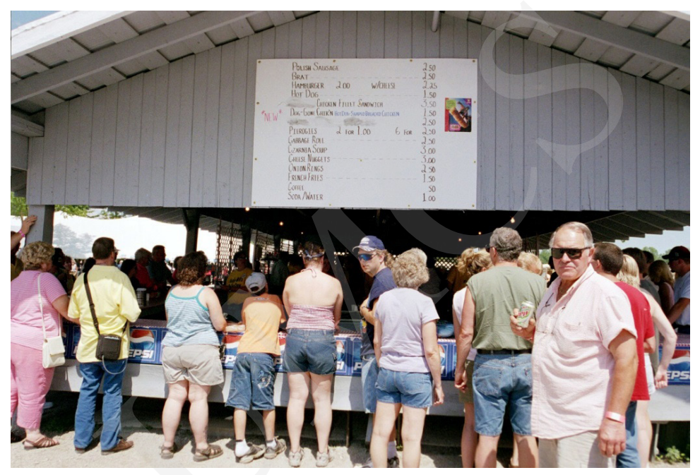
Figure 8. Food Concessions at Pulaski Polka Days, 2004.

Duck's Blood Soup], a dish virtually unknown in contemporary Poland (even absent from Polish dictionaries) but a classic for late nineteenth century émigrés from the Prussian partition of Poland. Five generations later, Polishness means Czarnina .