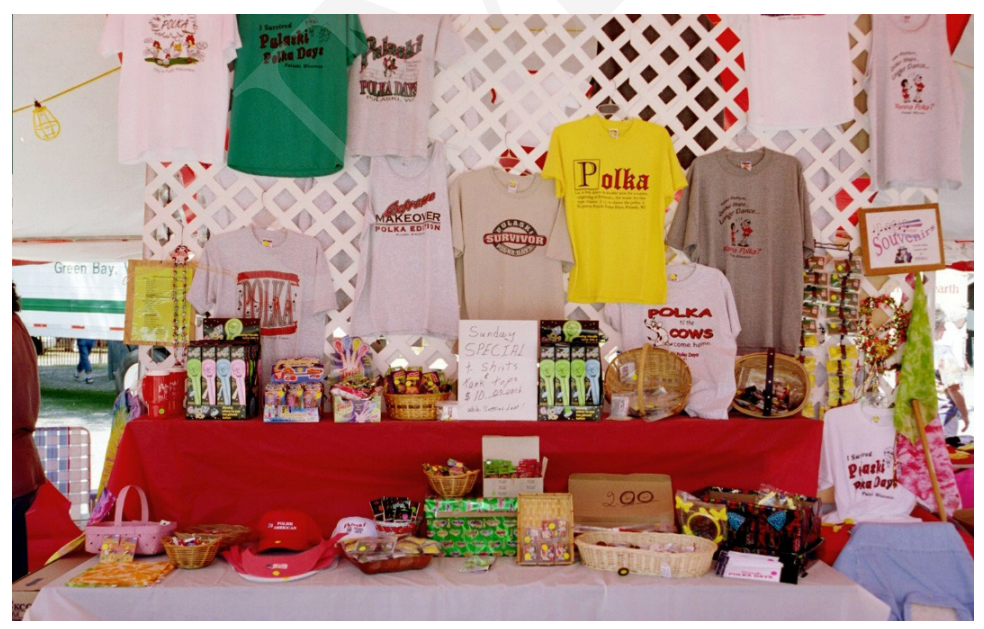
Figure 6. Souvenir Tent at Pulaski Polka Days, 2004.

This resilience is also seen in the polka community's ability to sustain an independent polka economy, a community-based business alternative to the mainstream of corporate music production (Gunkel 2004, 414). [See Figure 6] In addition to the festivals and conventions, this economy includes polka recording studios, production and distribution, record and CD labels, polka record stores, polka Radio shows polka cruises and travel, polka internet sites, polka associations such as the IPA (International Polka Association) and UPA (United Polka Association), and polka publications. [See Figure7]