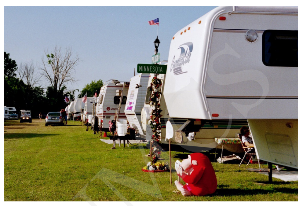
Figure 2. A motor home "village" at Pulaski Polka Days, 2004.