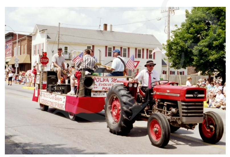
Figure 9. A postmodern pastiche of ethnic symbolism in Pulaski's Polka Parade, 2004.

The Pulaski polka parade is a virtual feast of hybrid ethnic symbolism. [See Figure 9] In a stunning moment of visual pastiche, an antiquated American tractor was driven by a farmer in a Górale [Polish mountaineer] hat, pulling a wagon that carried polka musicians. The wagon was decorated by American flags and a hand-written sign claiming "polka music evolves in Pulaski."