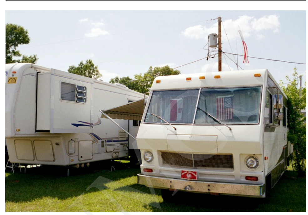
Figure 11. Mobile Home in the Ethnic "Neighborhood" displaying Polish American symbols.

In his critical work on cultural dimensions of globalization, Arjun Appadurai (1996) distinguishes between culture and the cultural. While culture is associated with a static conception of a people associated with specific traits, the cultural refers to situated differences, contrasts, and comparisons "that either express, or set the groundwork for, the mobilization of group identities" (13). Appadurai's distinction expresses the fluidity of identity associated with diasporic movements. Describing complex repertoires of images, narratives, and ethnoscapes, he notes that ethnic images are diasporic. Appadurai recognizes the synergistic and serendipitous nature of the flow of representations. I would argue that this is the nature of the symbolic landscape from which Polish American polka people draw to fashion their group identity. In this landscape, symbols of farm prosperity, twentieth century nationalisms, hybrid music, Polish folk culture, and American ethnic urbanism all emerge as a field from which polka people craft their sense of identity and belonging. This sense of Polish American identity is formed in the space of a mobile community of polka music fans who recreate a movable Polish American "neighborhood" on the festival circuit.