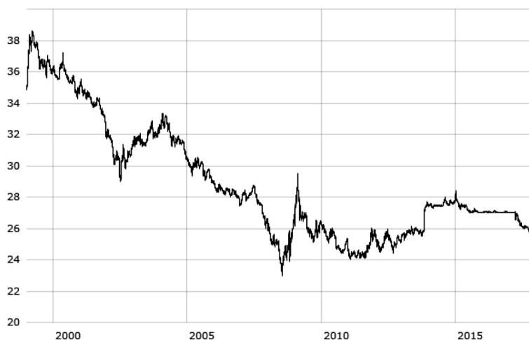
Figure 3. Fluctuations in the crown's rate in relationship to the euro, 2000–2017