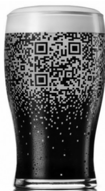
Figure 3. Creative utilization of QR code – Guinness brand