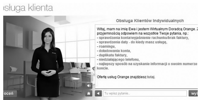
Figure 4. Virtual Orange Advisor – Ewa

An example of chatbot application in marketing communication is the Orange company. It has put in motion the Virtual Advisor Ewa on its own www page (Figure 4). Besides the extensive base of issues connected with customer service, this chatbot is able to answer a number of other questions 7 .