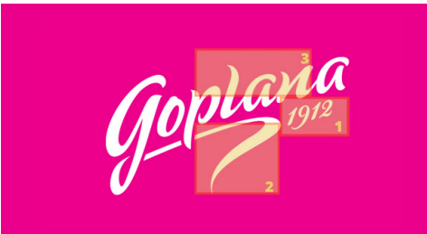
Figure 3. AOI for the Goplana company logo