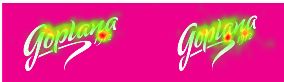
Figure 4. Eye tracking results for the Goplana logotype in the form of a heat map for research groups A and B