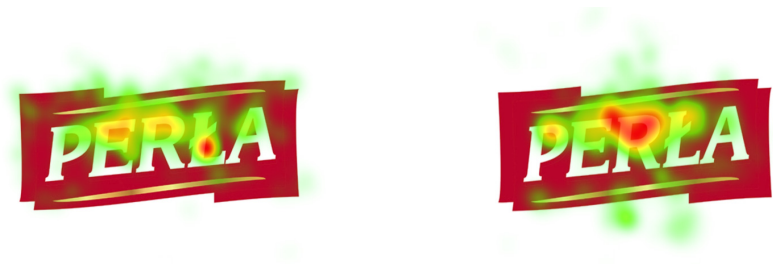
Figure 20. Eye tracking results for the PERŁA logotype in the form of a heat map for research groups A and B