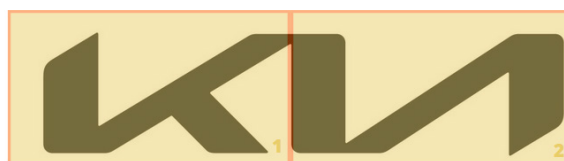
Figure 15. AOI for the Kia logotype