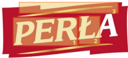
Figure 19. AOI for the PERŁA logotype