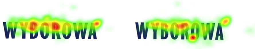
Figure 12. Eye tracking results for the Wyborowa logotype in the form of a heat map for research groups A and B

Source: Authors’ own study (image generated using iMotions software).