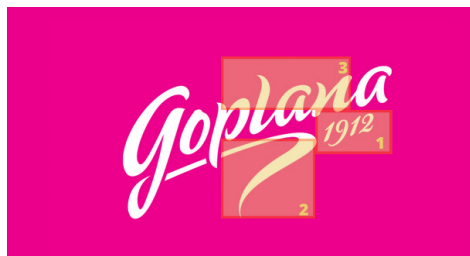
Figure 3. AOI for the Goplana company logo