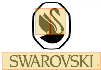
Figure 5. AOI for the Swarovski logo