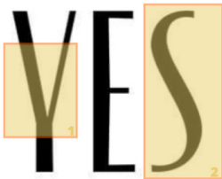
Figure 7. AOI for the YES logotype