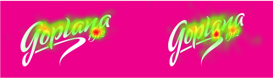
Figure 4. Eye tracking results for the Goplana logotype in the form of a heat map for research groups A and B

Source: Authors’ own study (image generated with iMotions software).