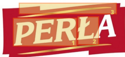
Figure 19. AOI for the PERŁA logotype