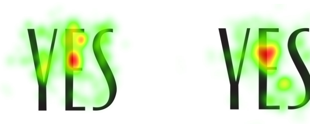
Figure 8. Eye tracking results for the YES logo in the form of a heat map for research groups A and B

The heat map results for both groups are similar. The increased attention in group B on the central part of the logotype may be due to the low complexity of the stimulus and the anticipation of displaying the next one.