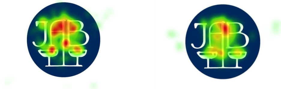
Figure 10. Eye tracking results for the logotype of the company J.A. Baczewski in the form of a heat map for research groups A and B

Source: Authors’ own study (image generated using iMotions software).