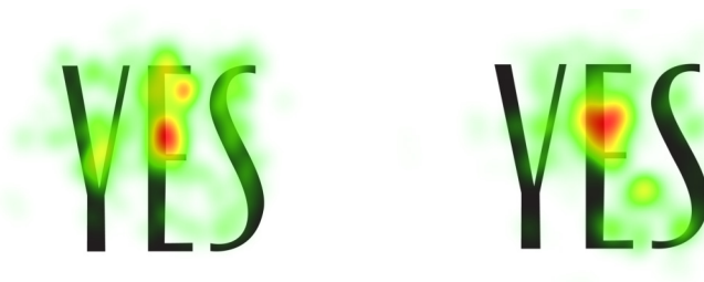
Figure 8. Eye tracking results for the YES logo in the form of a heat map for research groups A and B

The heat map results for both groups are similar. The increased attention in group B on the central part of the logotype may be due to the low complexity of the stimulus and the anticipation of displaying the next one.