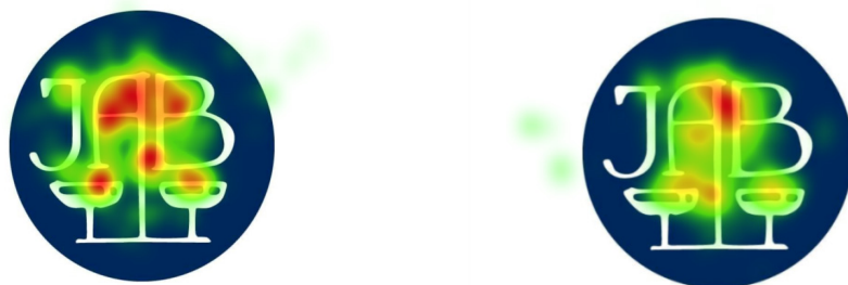
Figure 10. Eye tracking results for the logotype of the company J.A. Baczewski in the form of a heat map for research groups A and B

Source: Authors' own study (image generated using iMotions software).