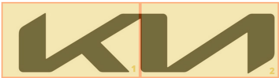
Figure 15. AOI for the Kia logotype