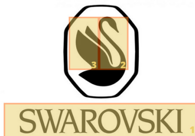
Figure 5. AOI for the Swarovski logo