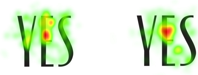
Figure 8. Eye tracking results for the YES logo in the form of a heat map for research groups A and B

The heat map results for both groups are similar. The increased attention in group B on the central part of the logotype may be due to the low complexity of the stimulus and the anticipation of displaying the next one.