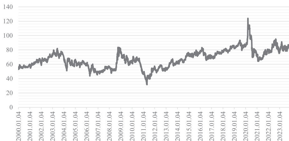
Figure 1. Price relation between gold and silver (gold/silver ratio) in the period 2000–2023

Adding to that, relating our findings to gold/silver ratio from the previous centuries, as we entered the 21 st century, irreversible changes in monetary policy took place, which meant that we no longer have to deal with the gold/silver ratio at such levels as in the 19 th and 20 th centuries. However, it can be noticed some repeatability in the channels (Figure 1) in which this ratio moves and the value of the 80:1 level for trends, which is both the level of support and resistance.