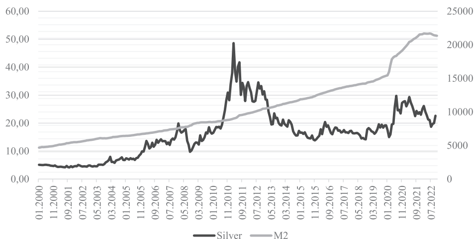
Figure 2. Silver price and USD supply measured by M2

In the case of silver market analysis, another indicator that may be important in determining the impact of external and non-market factors on its price is the money supply as measured by aggregate M2 (cash in circulation and deposits) in the United States (Figure 2).