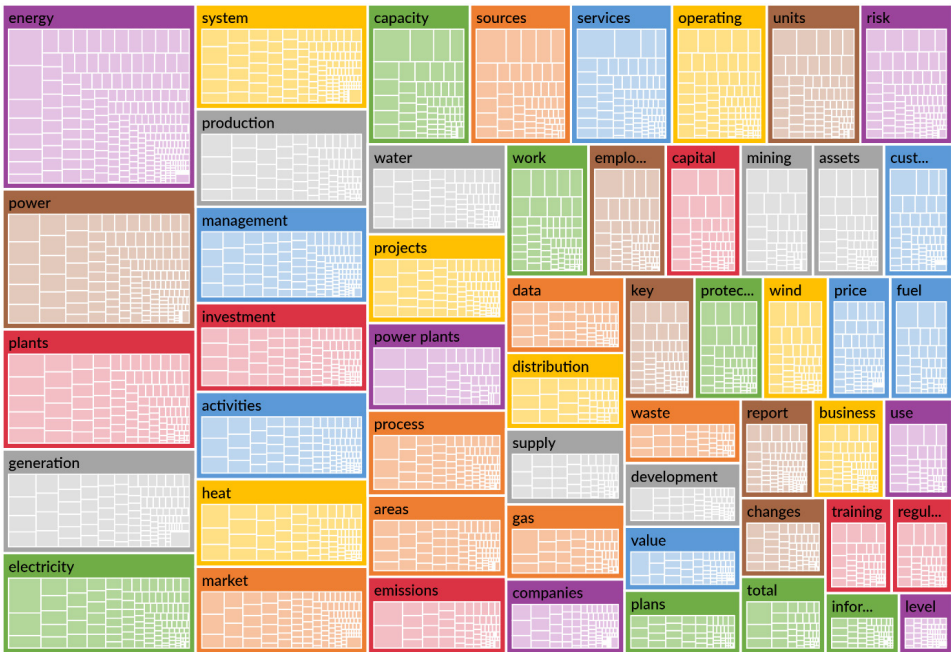
Figure 1. Hierarchy Chart – compared according to the amount of coding references (reports: ENA, PGE, TPE, ZEP)