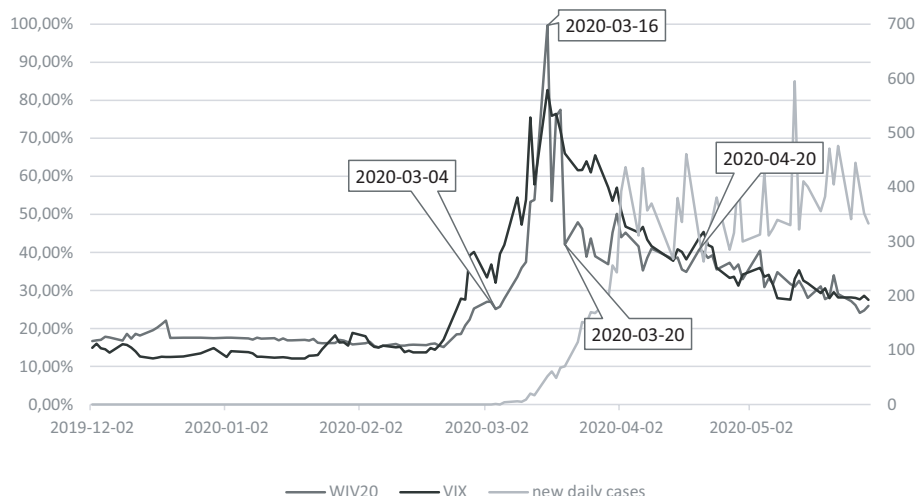
Figure 1. WIV20 and VIX indexes (a proxy of fear) and new daily cases of COVID-19 infection in Poland

Figure 1 presents the WIV20 and VIX indexes and new daily cases of COVID-19 infection in Poland during the period analyzed. This shows the relation between epidemic growth in Poland and increasing fear in the local and global context.