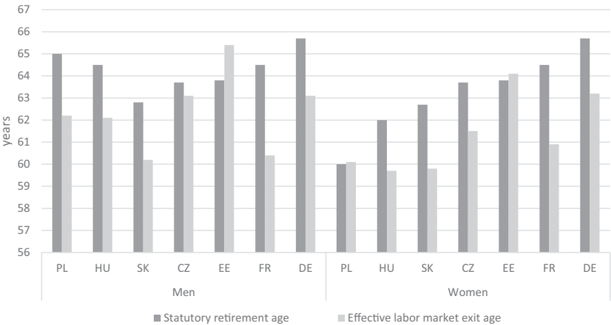
Figure 1. Statutory retirement age and effective labor market exit age in selected European countries

The empirical part of the article is based on primary research conducted in Poland (data for N = 448 respondents were collected with the help of an online questionnaire). The choice of Poland is motivated by three facts. First, Poland is one of the fastest aging countries in Europe (cf. UN, 2019; PARP, 2020). 2 Second, for women its official retirement age is the lowest in the European Union (cf. Figure 1). Finally, Poland is expected to experience the largest decrease in replacement levels in the European Union. 3