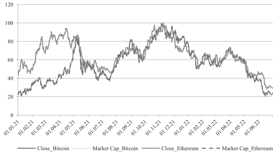
Figure 3. Standardized time series of Bitcoin and Ethereum quotations by Close and Market Cap categories in the period January 2021 – June 2022