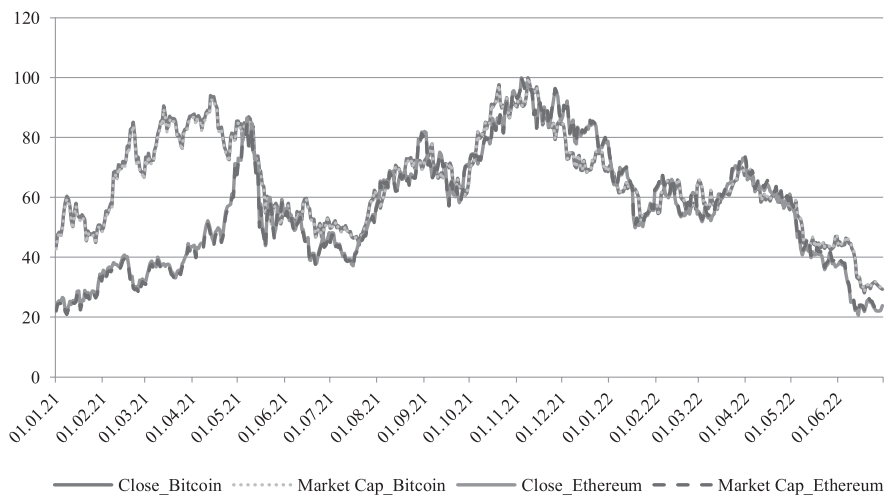
Figure 3. Standardized time series of Bitcoin and Ethereum quotations by Close and Market Cap categories in the period January 2021 – June 2022