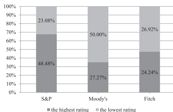
Figure 3. The highest and the lowest rating awarded by agencies

Furthermore, the analysis of the ratings awarded to the issuers by individual agencies was carried out, in order to check which agency gave the highest and the lowest credit ratings. For this purpose, the issuers which received the ratings from two or three agencies were analyzed. The issuers which received the rating only from one agency were excluded from this sample. The analysis does not also include the situations where the assessment of the agencies was the same.