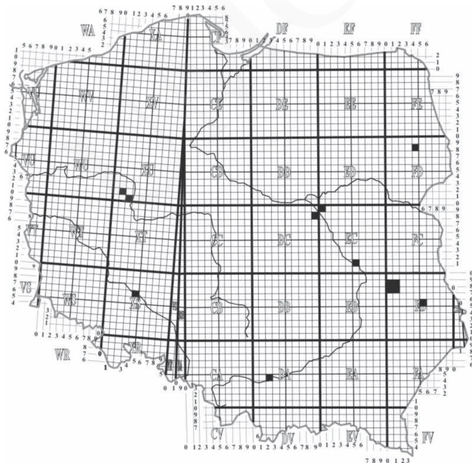
Fig. 4. Distribution of Uloborus plumipes in Poland.

First time recorded from Poland in 2001 from Białystok (101). Since 2002, this species was collected and observed in a number of localities in Lublin, and in several other Polish cities (87). Bigger populations which occur in large garden centers in Lublin may be described as semiautochthonic. They are formed by individuals reproducing partially in place, but these populations are still supplied with a number of specimens coming from almost every transportation of ornamental