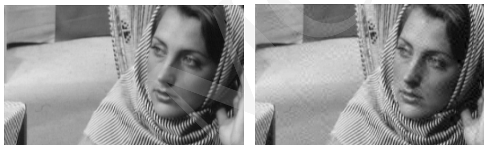
Fig. 5. Fragment of the original test image and its stegoed variant

KLT spectrum of its pixels. Hence, the message is being expanded into a longer sequence of small values e.g. binary ones. Then we have to generate a key which will determine where in the transformed blocks the elements of expanded message have to be placed. The key is a sequence of offsets from the origin of each block. It is important to place the message into the “middle-frequency” part of each block as a compromise between output image quality and robustness to intentional manipulations. This rule is especially significant in the case of images containing a large number of small details, which helps keep all the changes imperceptible. The only noticeable difference can be observed in the areas of uniform color. As an example of the embedding, the following image is presented (see Fig. 5).